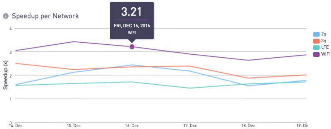
Figure 1: PacketZoom Speedup across networks

GOAT saw an immediate ROI and significant boost in user engagement, including a 12-percent increase in product search and view requests. Lu reported an additional benefit: Since PacketZoom is a CDN enhancer and not a replacement, PacketZoom automatically offloads mobile content caching from the CDN. For GOAT, this means a significant reduction in CDN bills -- up to 90 percent a month.